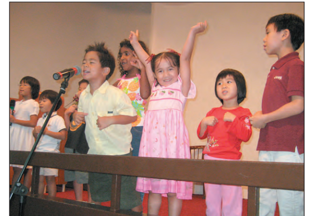
KSS children's song item during Family Night, Sept 2006

The Brethren tradition seeps deep within my bones. I cannot remember any time when the Brethren tradition was formally taught either over the pulpit or the Sunday School. Yet it seeps deep within me. I recall the six years when I was helping in a Presbyterian Church where the Minister had such an influence on the congregation especially with regard to the celebration of the Lord's Supper. It made me sit up and ponder and look back at my Brethren tradition. It forced me to research into the history of the Brethren movement and the rationale of the major practices of the Brethren movement. I am now serving in Frankel and I hope I can be used by God to contribute to the Brethren movement in Singapore especially in helping Christians to renew their love for the Word and to treasure their relationship with God.