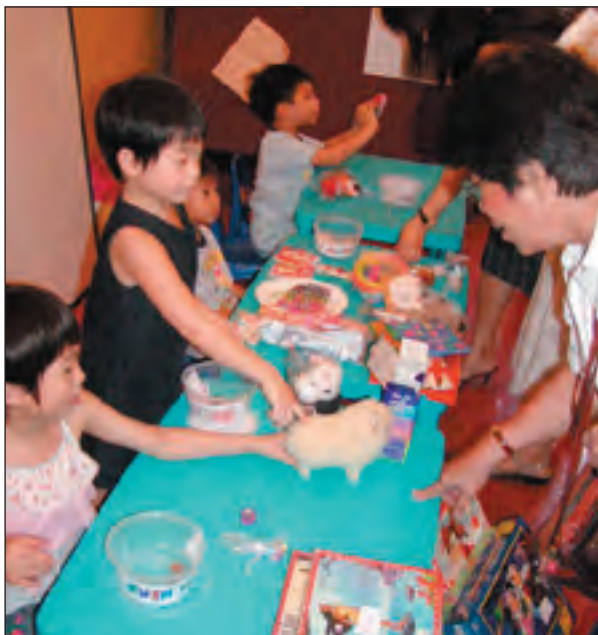
Children "selling" their artworks during Children's Day Fair, 2005

With the responsibility of caring for my family, I have had less opportunities to meet with the earlier groups of people mentioned. I still try to meet with some people of similar age and responsibilities.