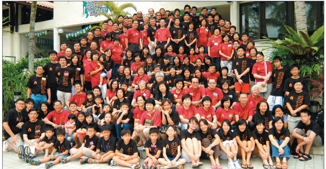
Campers at Church Camp 2006 at Sofitel Resort, Johor Bahru