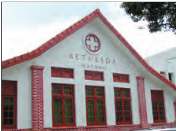
External view of the church

I thank the Lord for using Bethesda Katong to provide me with the foundations of my early walk with the Lord; I thank the Lord for the elders that spoke into my life and I thank the Lord for the fellowship of believers that helped to shape me into the body of Christ. When, in 1955, I went to Bedok Methodist Church for 27 years to be their Choir Director and later called to serve in para-church ministries and to plant churches; the blessings of my early days at Bethesda Katong made me understand that I never left the church and had all the time always been a part of the same body of Christ as from the day I accepted Jesus as my personal Lord and Savior. This understanding of the body of Christ was indelibly implanted in my psyche from my youth. I thank the Lord for Bethesda Katong and wish to bless you for having been a part of my life. Allow me, in Paul's words to pray that "He who began a good work in you will carry it on to completion until the day of Christ Jesus".