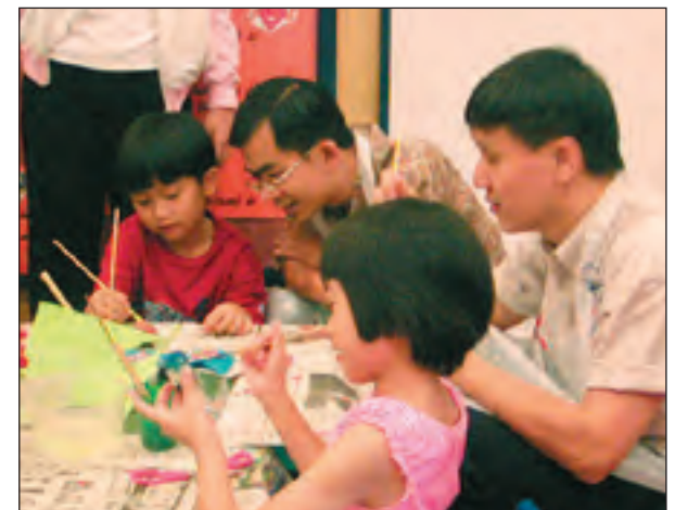
Children and fathers enjoying time of craftwork during Father's Day, 2005