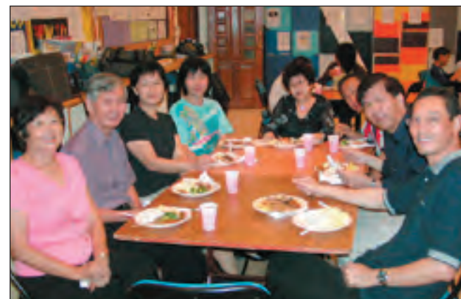
Mandarin congregation members at Year-End dinner, 2005