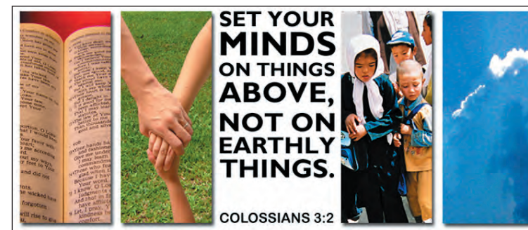
From top to bottom, theme banners from 2003 to 2005