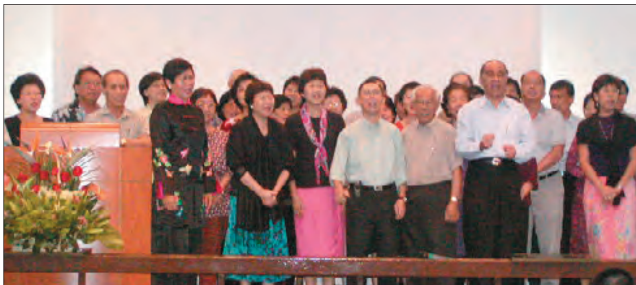
Senior Citizens performing at year-end fellowship dinner, 2005