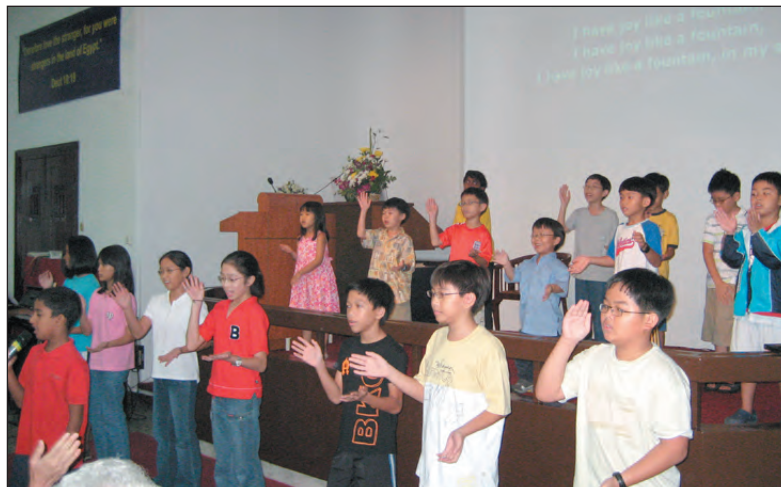
JSS song item during Family Night, Sept 2006