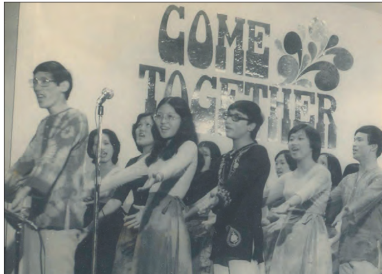
‘Come Together’ music team

May the Lord also continue to bless the “mother-church” with its “daughter-churches” as I continue in faith and service in Bethesda (Frankel Estate) Church.