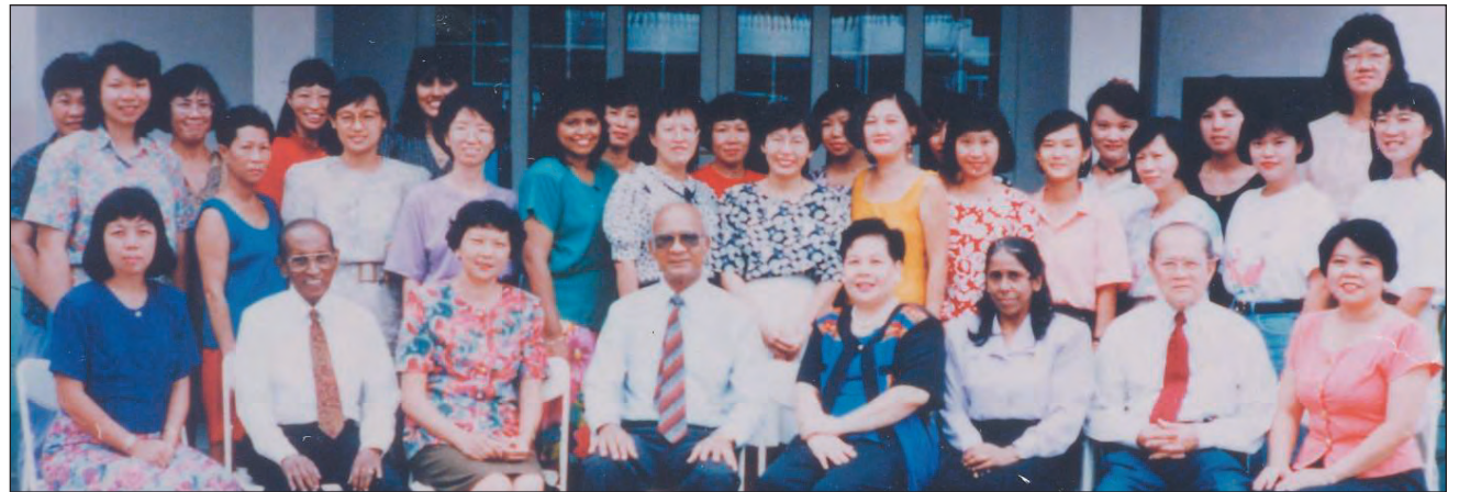
Principal and teachers of Bethesda (Katong) Kindergarten