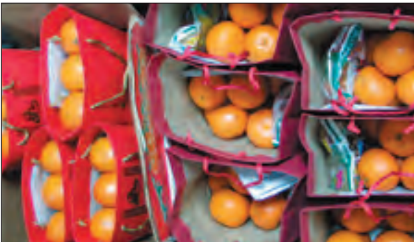
Preparing for Neighbourhood visit

Being trained in, and sensitive to, architecture and design issues, I have had opportunities to use my training to help improve the church physical facilities. Some of my memorable times were to create designs for the year's theme verse and have them printed by a half-way house for ex-offenders. It brought joy in knowing that such designs helped provide jobs and income to people, and also remind church members of God's ways and will.